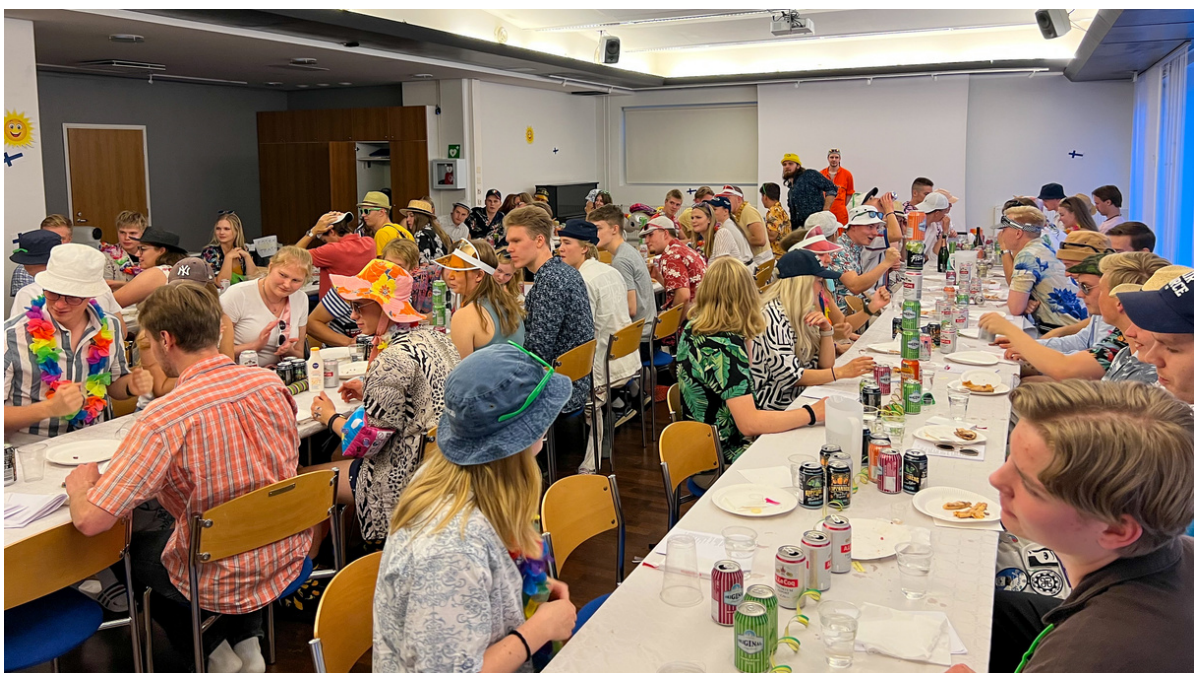
Indecs' fux-sits 2023 at renewed Laulumaja

The renovation itself went surprisingly well. With the hard work of renovation team and the help of Indecs' board members every now and then, the renovaCon was completed only in three weeks! In this renovation, the hall, the ball room and the catering/meeting area were under work, while the kitchen and restrooms are still waiting their turns to get a fresher look. The first customer used the renewed venue on the 1st of September, and alert that the venue has been in use multiple times in a week. In fact, for the period from the beginning of October to Christmas, there are only a pair of weekend evening available while writing this, in addition to constantly increasing weekday reservations. Ergo, all is going as calculated!