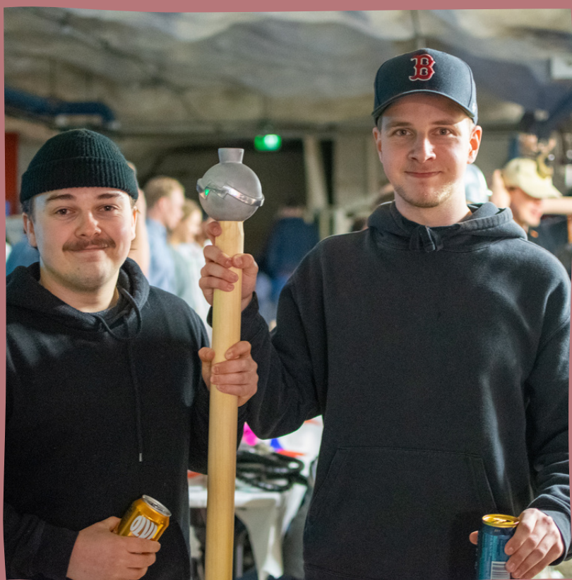
BIG VARIETY OF DIFFERENT EVENTS!