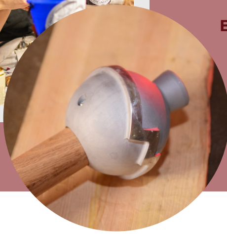
AND NEW MASTER OF CEREMONIES' WAND