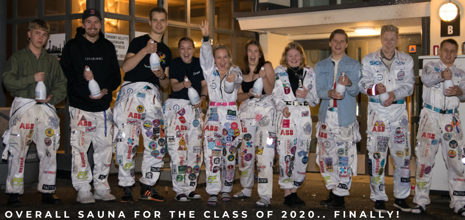
OVERALL SAUNA FOR THE CLASS OF 2020.. FINALLY!