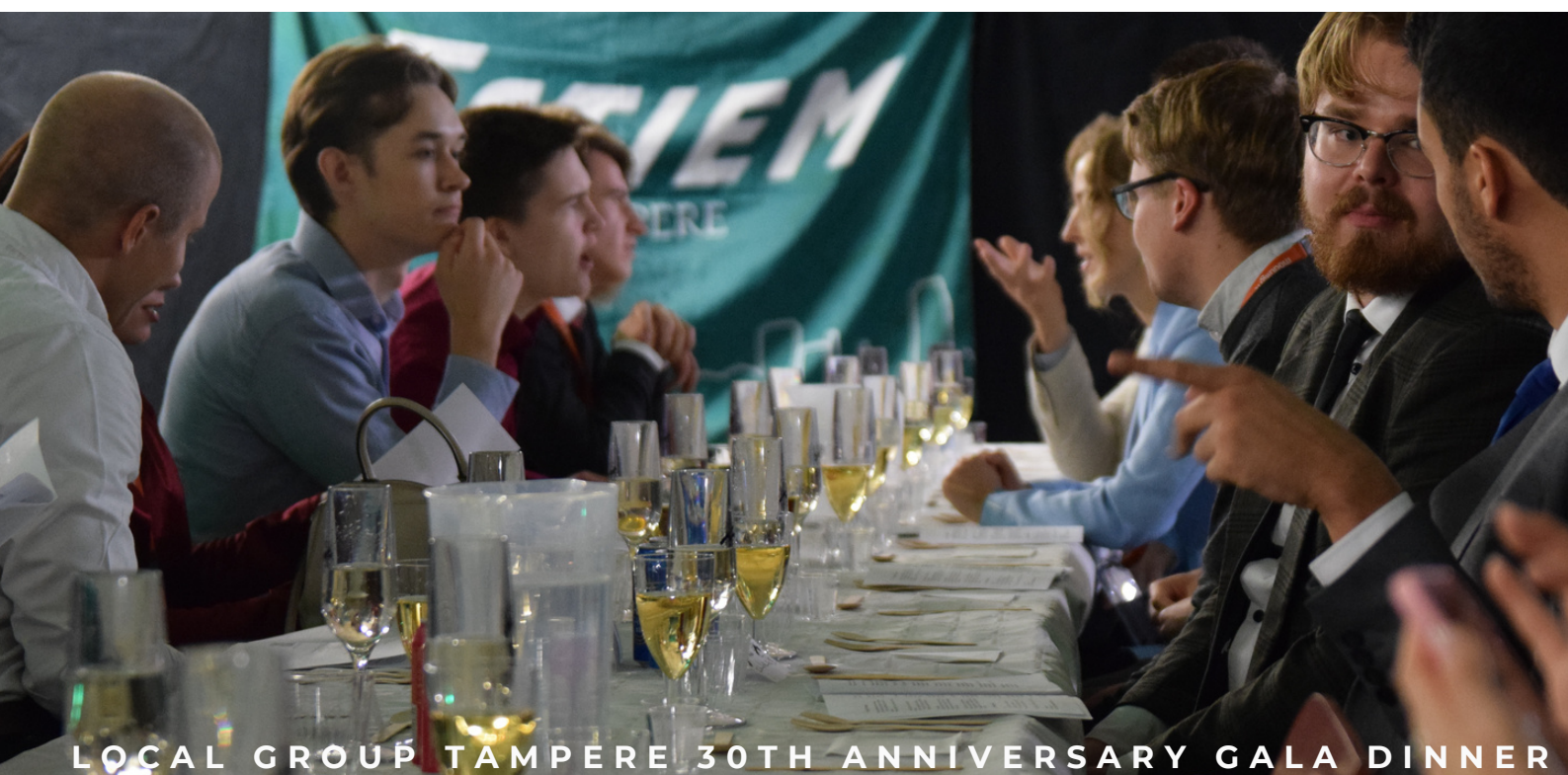
LOCAL GROUP TAMPERE 30TH ANNIVERSARY GALA DINNER